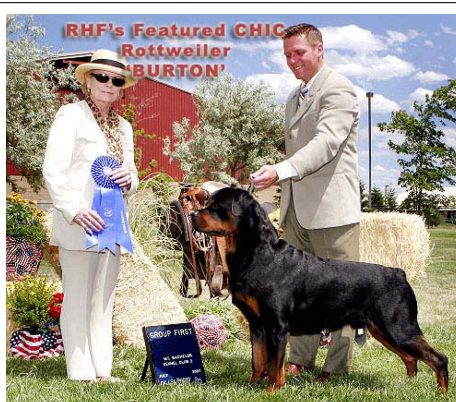
BIS/BISS Select 1 Am/Can Ch Ravenscrest The Alchemist HIC, CGC, TDI "Burton" CRRC Honor Roll, RCC Hall of Fame eligible OFA Excellent, OFA Elbows, OFA Cardiac, CERF'03 CHIC #21335

If you love a (Rottweiler) dog, they'll return it to you 'three-fold plus'©, and that's good.